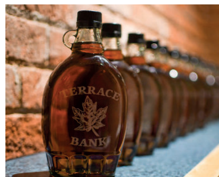
MAPLE SYRUP GENEROUSLY OFFERED BY TERRACE BANK FARM TO ALL AYRSHIRE CANADA AGM ATTENDEES.

You may access all production and recognition results on the Ayrshire Canada website