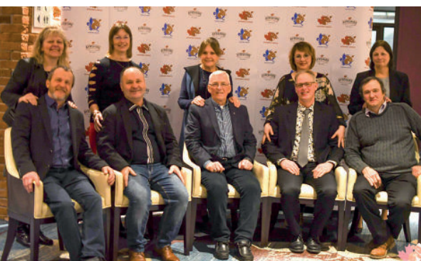
WHILE WAITING FOR THE BANQUET TO START, WE TAKE A PIC.

The Annual Congress also serves to recognize high performance in produc-