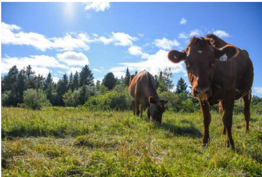
Ferme Plein Soleil (2010) inc.