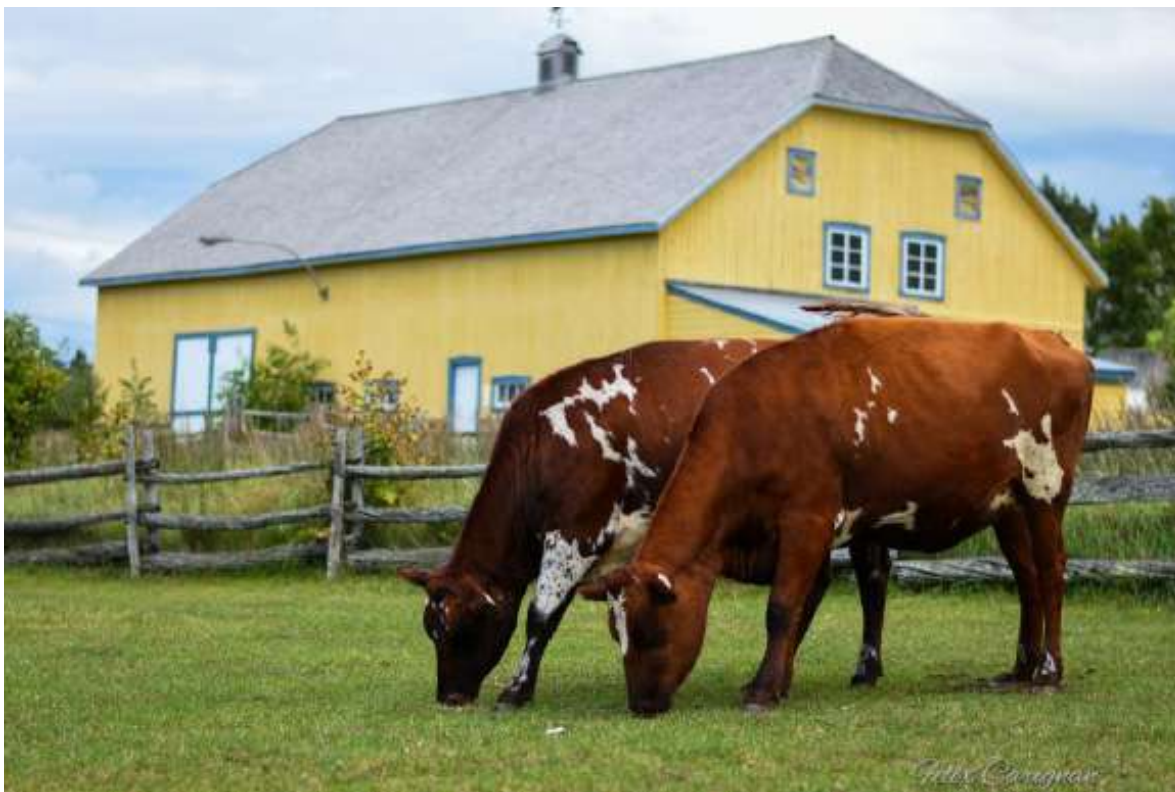
Fireball Ayrshire * Photo credit: Félix Carignan

27.1.9 Transfer of ownership fees shall be paid by the seller, in accordance to Section 32.