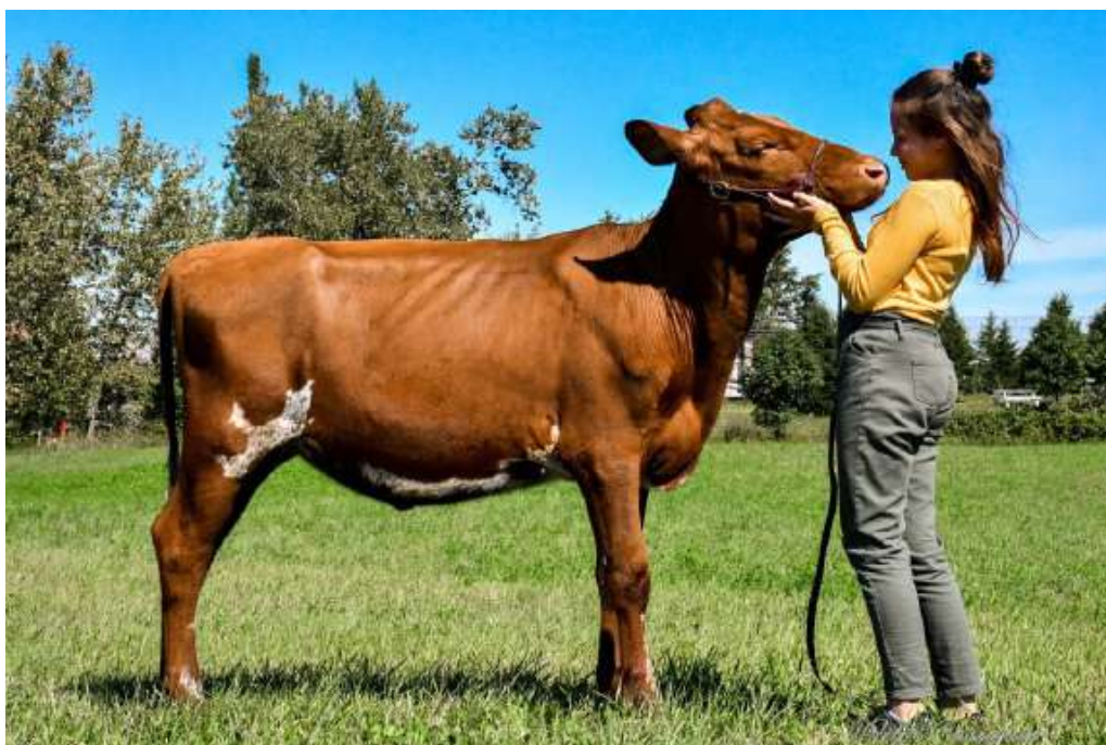
Ferme Réka