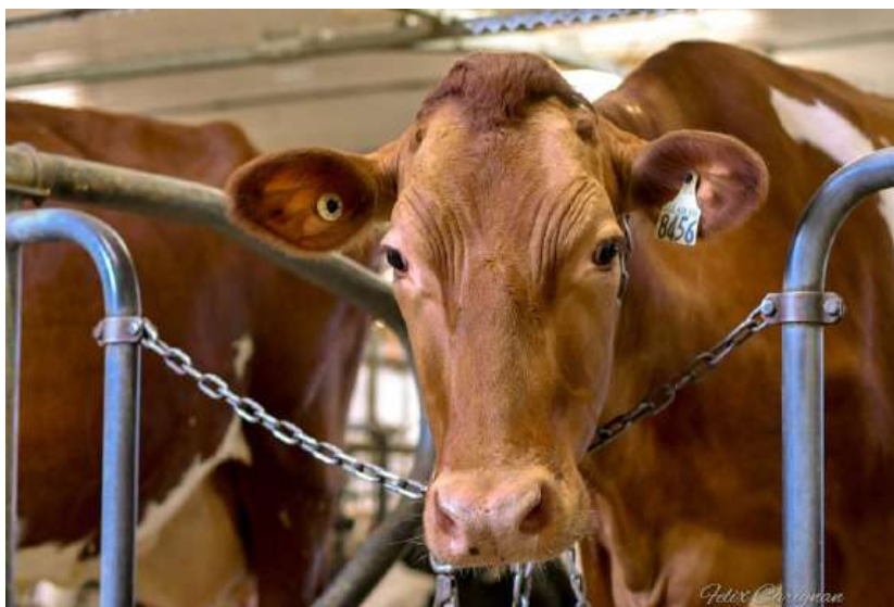
Ferme du Bois-Brulé * Photo credit : Félix Carignan