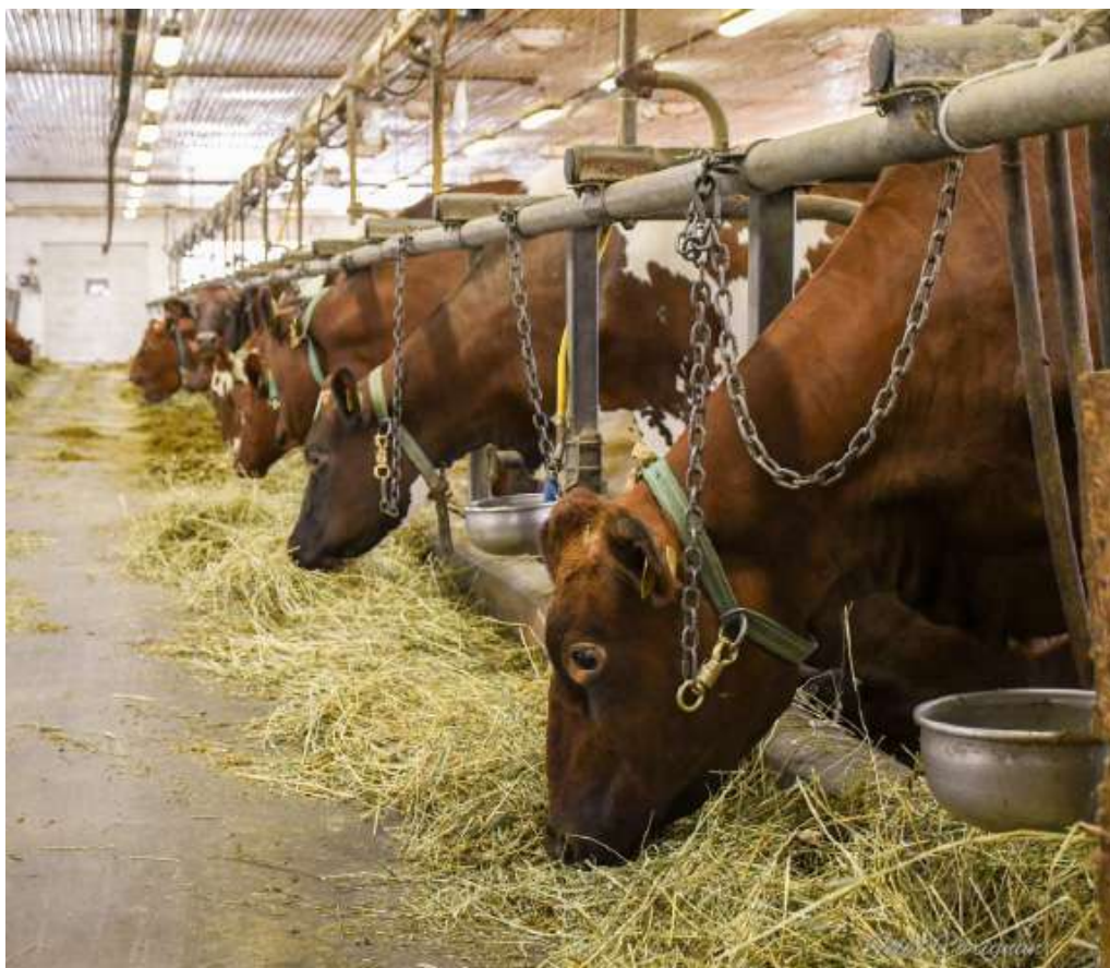
Ferme De la Tour