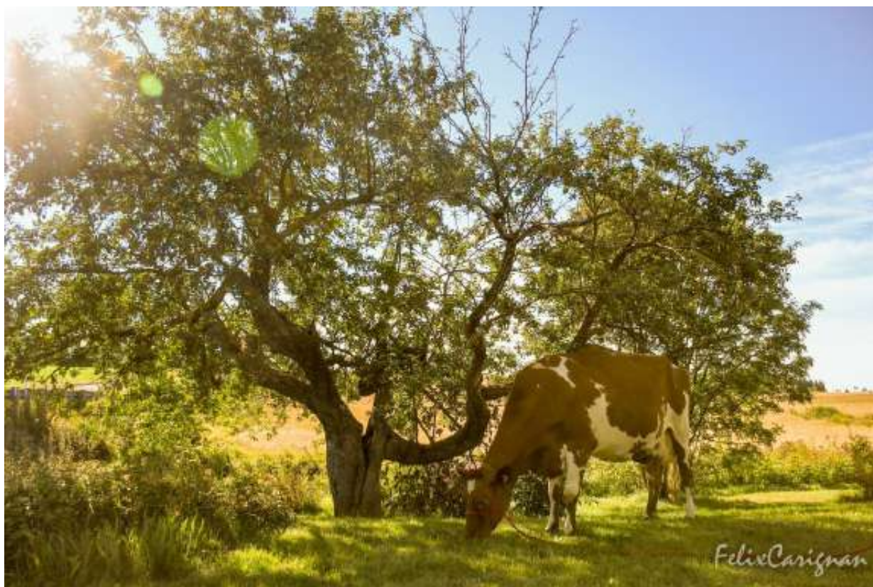
Ferme Robichaud

See accompanying notes to financial statements.